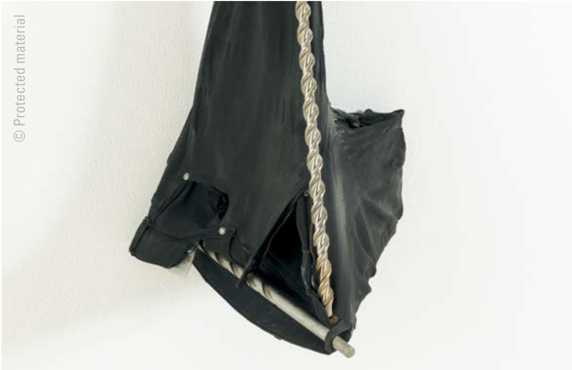
© Protected material June Crespo Axes (Amsterdam Ja. 2017 Bilbao Dec. 17) 2018 Trousers, acrylic resin and drill bits for cement. 112 x 37 x 40 cm Neri Pagnan Collection

Back in 2018. Foreign Bodies. An exhibition at P420 Galleria d'Arte in Bologna featuring works by John Coplans and June Crespo, Foreign Bodies unfolds like a conversation: the enlarged close-ups of the photographer's naked body parts on the wall reply to the sculptor's objects and volumes on the floor; the folds and wrinkles of the aged skin in the black-and-white photographs answer the assemblages of cement, "youthful" second-hand clothing, belts and pigments of structures in which materials interact with each other through folds, twists and couplings.