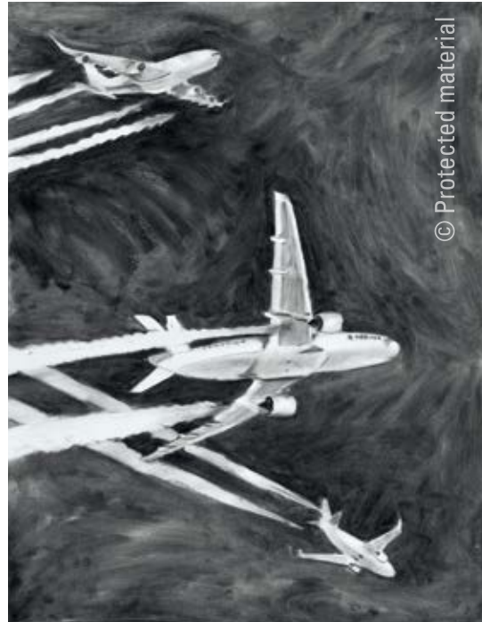
Juan Pérez Agirregoikoa The Muntadas Syndrome 2009 Series of 36 drawings Charcoal on paper. 100 x 75 cm