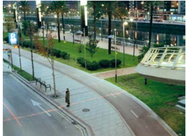
Itziar Okariz ¿Dónde estás justicia? (Where are You, Justice?) 2008 Performance

Let's give it a try: Back in 2008 . A high-angle shot of a bland new urban landscape by night. A landscape dominated by the orderly forms, shiny surfaces and synthetic materials typical of today's urban areas, products of development plans that wipe the slate clean, leaving no trace of what once existed there. The view has an air of virtual reality. We might be looking at any city on the planet, or a scale model in an architect's studio. Various parallel lines—two tram tracks in the middle and, on either side, a station platform, a car lane, a stretch of pavement and a cycle lane—run across the image and fade into the distance at the top. Two colours dominate the composition: the garish green of the signage on the shelters and the grass covering the iron tracks; and the metallic grey of the pavement, the tram rails and the street furniture—shelters, railings, street lamps, etc. A handful of figures are strolling along the pavement or waiting for the next tram. One seems blurred as it crosses the track in the wrong place. The figure's path follows a straight, fluorescent-orange line perpendicular to the rest of the lines in the picture (rails, platforms, lanes, pavements).