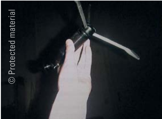
Marion Cruza 1,020 items 2014 Performance-screening, varying length (15'-17')

Back in 2014. An action/screening at Larraskito Kluba. On the screen, a sequence of images. In the background, a low, nervous sound coming not from the screen but from somewhere else in the room, a tell-tale sign that this is happening in real time. Someone is using a laptop keyboard to edit the images on the spot. The montage of 1,020 Items (2014) creates a concentrated, syncopated rhythm of forward and backward leaps, pauses and bursts of speed.