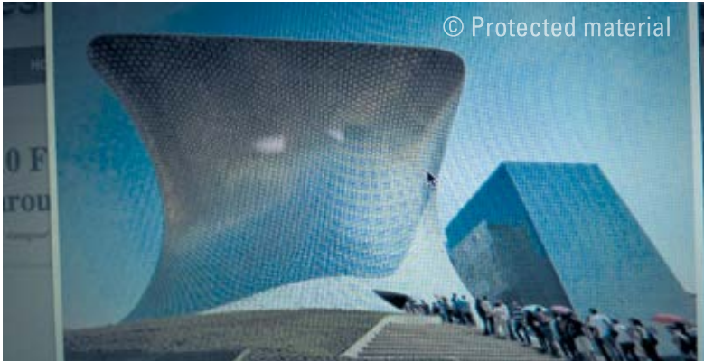
Erlea Maneros Zabala Pilgrimages for A New Economy (Museo Soumaya, 2011, Mexico City, Mexico), 2012 Digital print made from analogue photograph. 41.3 x 52.1 cm

Back in 2009. Several black-and-white photographs, some positives and others negatives. They are views of Los Angeles, the city which, at the end of the 20th century, embodied the urban ideal for the new global era, the age of the rootless, centre-less, fragmented post-metropolis where every district, every neighbourhood feels like the suburbs. Taken at different locations across the city, each photograph features a hoarding. Other typical elements of the LA landscape are clustered around it: a straight street that extends outside the photo frame, immense cloudless skies, tropical trees, roads with passing cars, pavements, buildings and vacant lots. But there is an anomaly in the photos that does not tally with the typical image of the city: the hoarding that dominates each picture is blank.