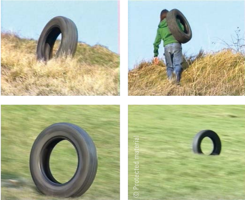
Ibon Aranberri Firestone , 1997 Single-channel video, colour image, without sound, 16' Bergé Collection

Back in 1997 —now in italics 2 —also alluded to another temporal aspect, this time of a structural nature. The title, which retrospectively referenced something that had happened a short time earlier as if referring to an event from the distant past, signalled something which now seems quite obvious: time passes swiftly, but in recent years its acceleration has become unstoppable, like a tyre picking up speed as it rolls down a slope.